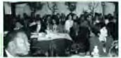
"Engaging People in Sustainability" workshop participants gathered for the summit in Johannesburg, South Africa, in 2002.

The workshop was a landmark event in the history of sustainable development, bringing together leaders from 189 countries to discuss and agree on a new global development agenda for the 21st century. The workshop was a landmark event in the history of sustainable development, bringing together leaders from 189 countries to discuss and agree on a new global development agenda for the 21st century.