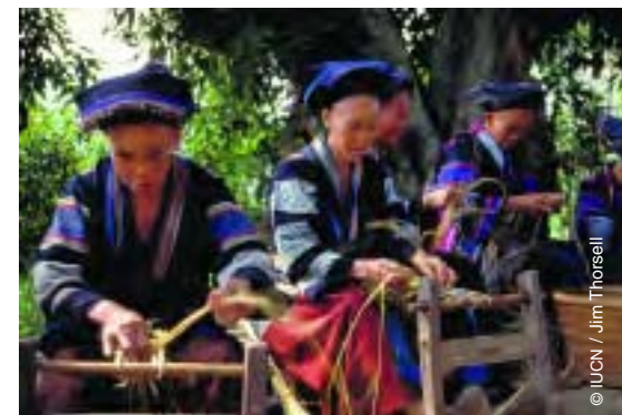
Basket works in China

Partnerships are also at the core of the implementation plan for the UN Decade on Education for Sustainable Development 7 . They are key components in education for sustainability programs across the spectrum, from formal education to community-based projects, and from international networks to regions within one country. In education for sustainability, planners and managers can increase the