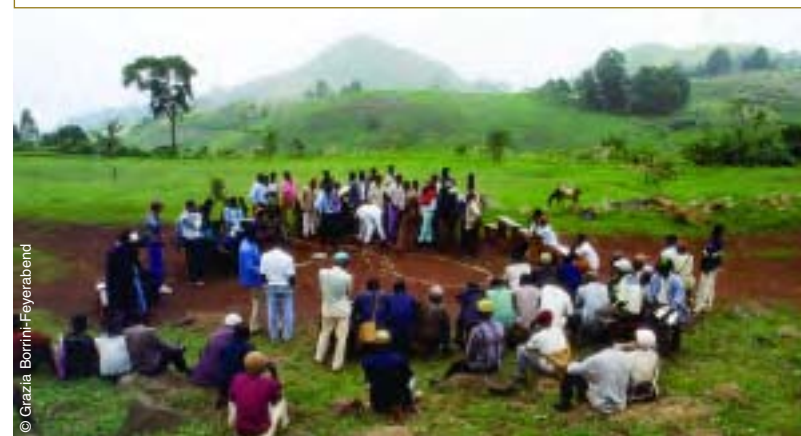
Mt. Kilum, Cameroon community planning